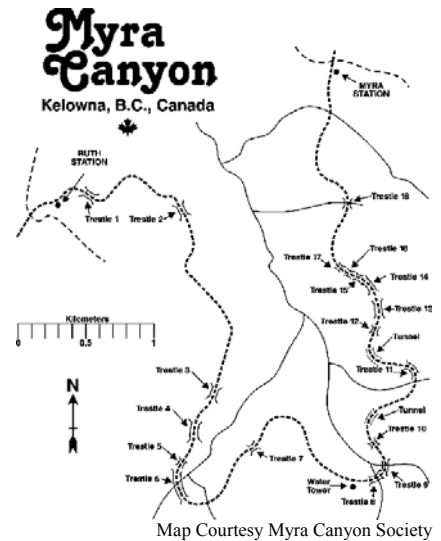
Map Courtesy Myra Canyon Society